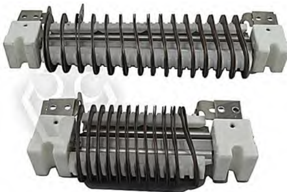
High Current Oval Edge-Wound (DOE)